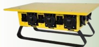
UL listed with GFCI Portable Power Center