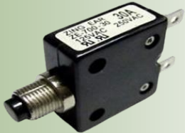
Push Button 30 amp